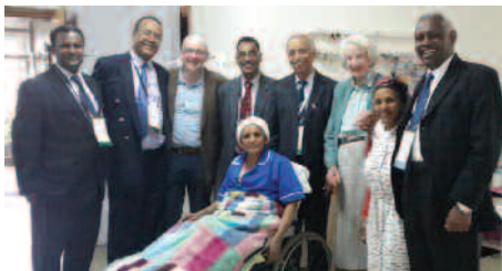
The FIGO leadership and colleagues from the African Federation of Obstetrics and Gynaecology (AFOG) meet Dr Catherine Hamlin

During the conference, a visit was made to the Hamlin Fistula Hospital in Addis Ababa ( www.hamlinfistula.org ) which is now the main training centre for FIGO Fellows. Dr Catherine Hamlin was met during the visit, and all present expressed admiration for the excellent work being performed in the institution to help women in great need.