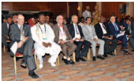
The FIGO leadership with conference officials

The first FIGO Africa Regional Conference of Gynecology and Obstetrics, held in Addis Ababa from 2–5 October 2013, was a 'great success', attracting over 800 attendees from approximately 70 countries.