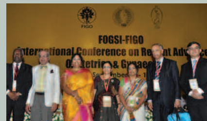
The FIGO leadership with conference officials