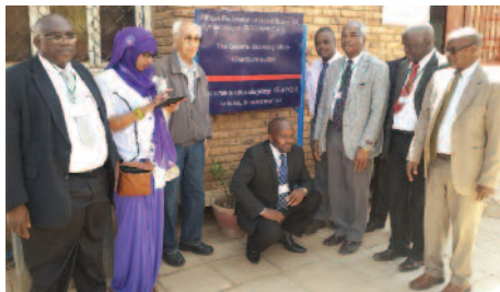
Outside the new AFOG Secretariat in Khartoum

In late February, I travelled to Khartoum to attend the General Assembly of the African Federation of Obstetrics and Gynecology (AFOG), FIGO's most recently recognised Regional Federation. This took place during the 26th Congress of the Sudanese Obstetrical and Gynaecological Society. The meeting was attended by representatives of 22 societies of African Obstetrics and Gynecology. Discussions to