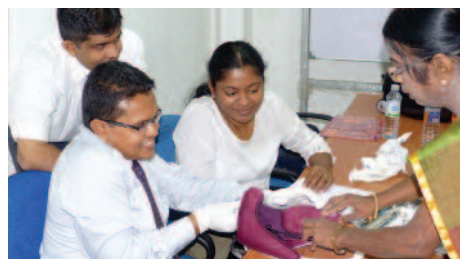
The FIGO PPIUD project

One of the unmet needs of women's health is contraception, a key component of Millennium Development Goal 5.B: Achieve universal access to reproductive health. FIGO is now running a project, beginning in Sri Lanka, for 'Institutionalising Post-Partum IUD [Intrauterine Device] Services and Increasing Access to Information and Education on Contraception and