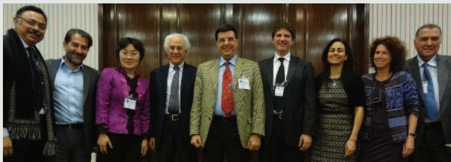
Best Practice on Maternal-Foetal Medicine Working Group meeting (London)

In 2014, the 'Best Practices' Group will focus on folic acid supplementation, prediction and prevention of pre-term birth and non-invasive prenatal diagnosis and testing.