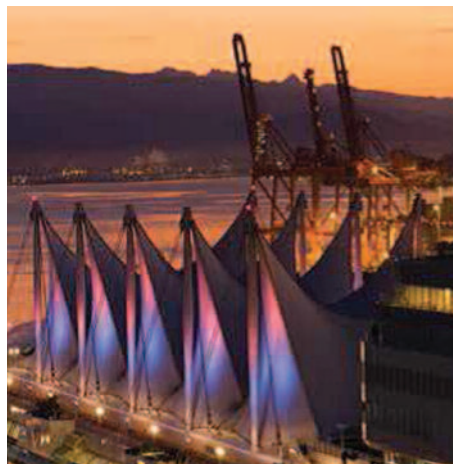
Vancouver images are kindly supplied by © Tourism Vancouver and © Vancouver Convention Centre