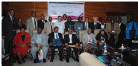
AFOG group photo

The 66th Annual Congress of the Japan Society of Obstetrics and Gynecology took place in mid-April, and I was delighted to represent FIGO alongside other FIGO colleagues at its International workshop for Junior Fellows. These workshops are a vitally important and precious opportunity for young Fellows to progress in their knowledge, and to gain confidence in their specialities. As always, we were the recipients of superb hospitality.